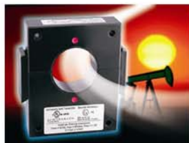
ISCTH Type 8 ATEX and UL approved for Intrinsically safe environments

Model ISCTH type 8 intrinsically safe, models from 100A to 2500A