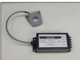
CTH Type 2 through hole

Type 2 current range 2A - 600A 24-5mm hole via a 90cm (36") cable. As standard the sensor is supplied connected via cable.