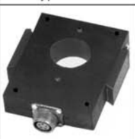
CTH Type 4 mini

Type 2 current range 2A - 600A 24-5mm hole via a 90cm (36") cable. As standard the sensor is supplied connected via cable.