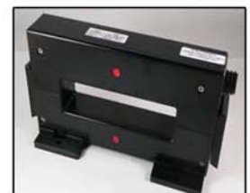
CTH Type 9z

Hole: 115mm x 33mm (4.5" x 1.25") rectangular hole