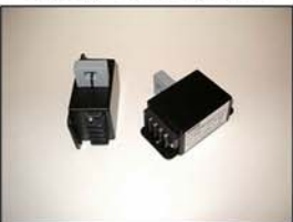
CTH Type 1 through hole

Type 1 current ranges: 1A through 100A 10 x 13.5mm hole Type 2 current ranges: 0-5A to 0-600A, 25.5mm