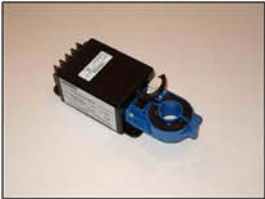
CTH Type 5 split core

Type 5 current range DC-25kHz 20A - 400A. 21mm hole As standard the sensor is supplied connected via a 90cm (36" cable)