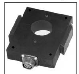
CTH Type 4 and CTH split core Type 8

Hole: 50mm (2") round hole Current ranges: CTH 200A through 2500A 240cm (8') cable.