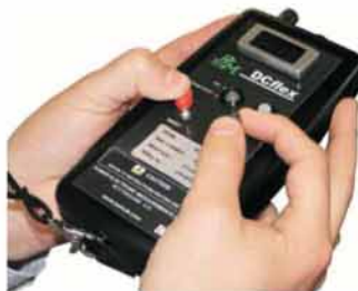
Press the reset button. Null the offset trimmer to zero

The DCflex current probe is simple to use