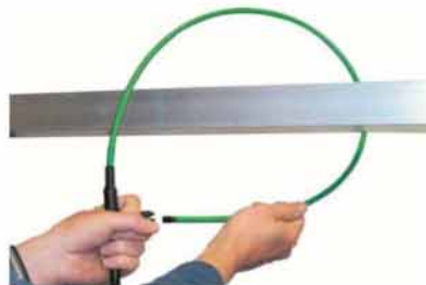
Clip the probe around the dc busbar