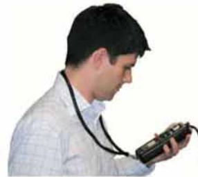
Take the reading