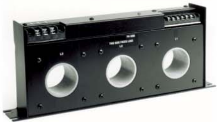
Three Phase Power to 1000HP