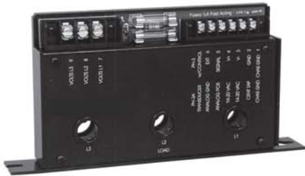
Three Phase Power to 150HP